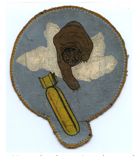
569 Bombardment Squadron emblem